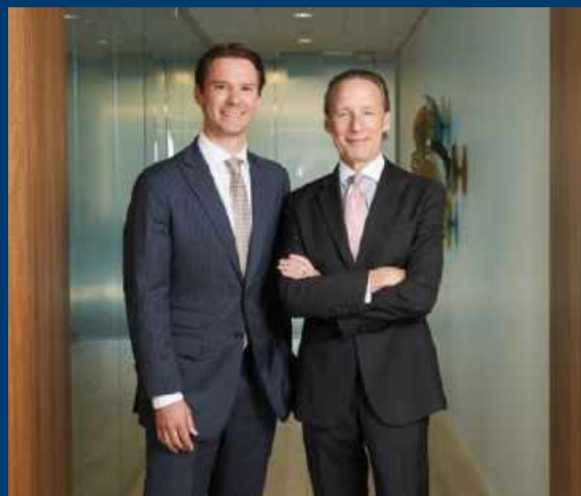
Salvi, Schostok & Pritchard highlighted among top 3 Illinois law firms in 2019 Chicago Lawyer Settlement Survey.